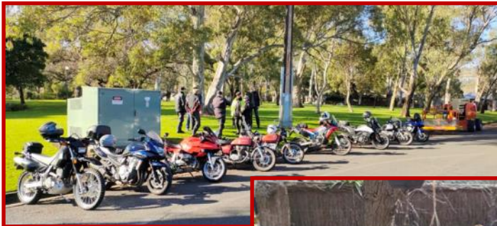
< Ready to Roll at Hazelwood Park