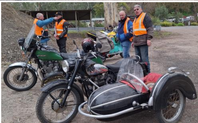
BSA 1959 500cc > outfit