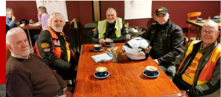
^ Loebethal warm up stop