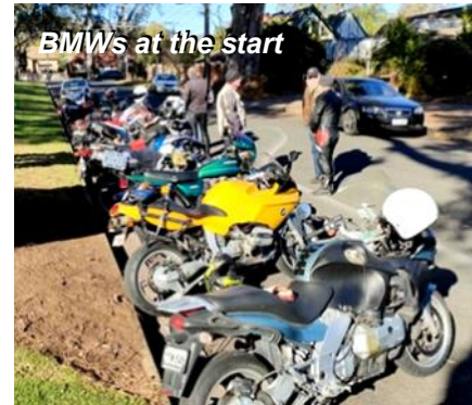
BMW's at the start