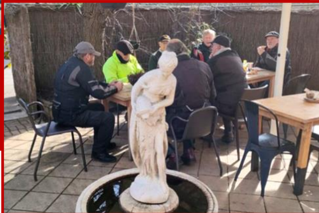
Morning Tea stop in Nairne >