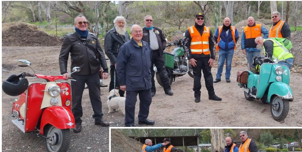
^ Group photo Williamstown