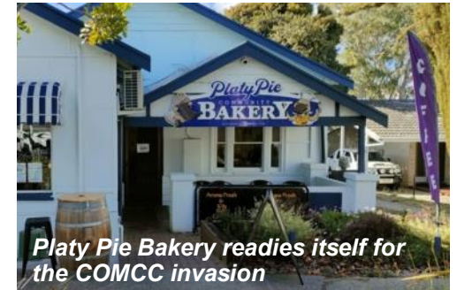
Platy Pie Bakery readies itself for the COMCC invasion