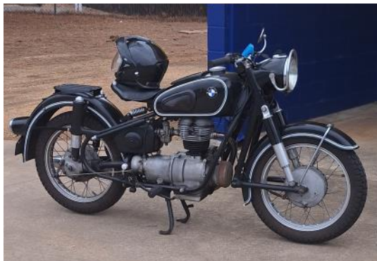
1957 BMW 250 cc

There was a good turnout of 9 bikes on the day with three Suzuki's, two BSA's and two Zundapp's shepherded by a Norton and BMW. The temperature was quite cold with cloudy skies. Although this suited the older bikes as we headed to Mt Pleasant, the riders were pleased to get inside the bakery and warm up over lunch.