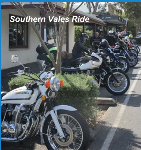
Southern Vales Ride