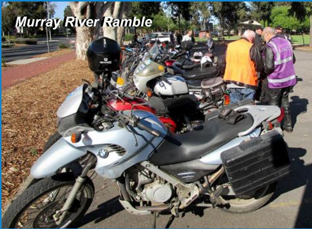
Murray River Ramble