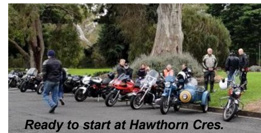
Ready to start at Hawthorn Cres.