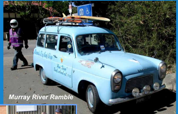
Murray River Ramble