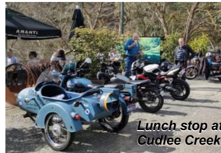
Lunch stop at Cudlee Creek