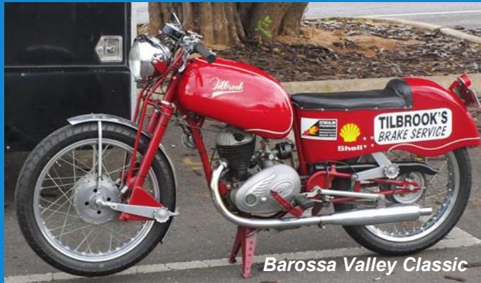
Barossa Valley Classic