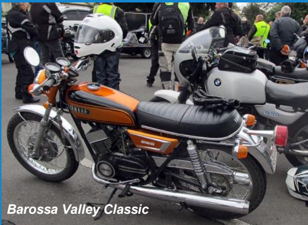
Barossa Valley Classic