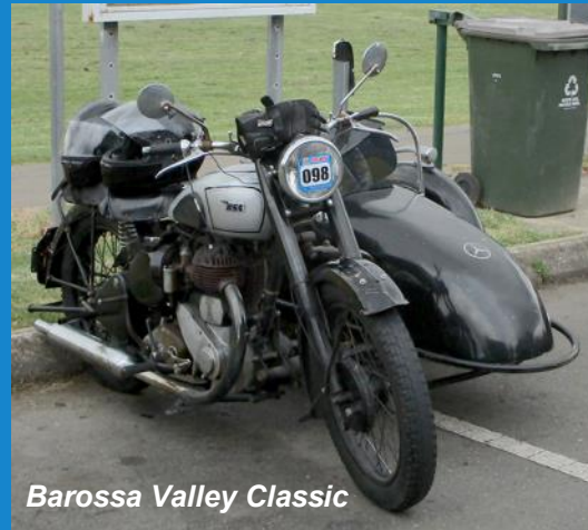
Barossa Valley Classic