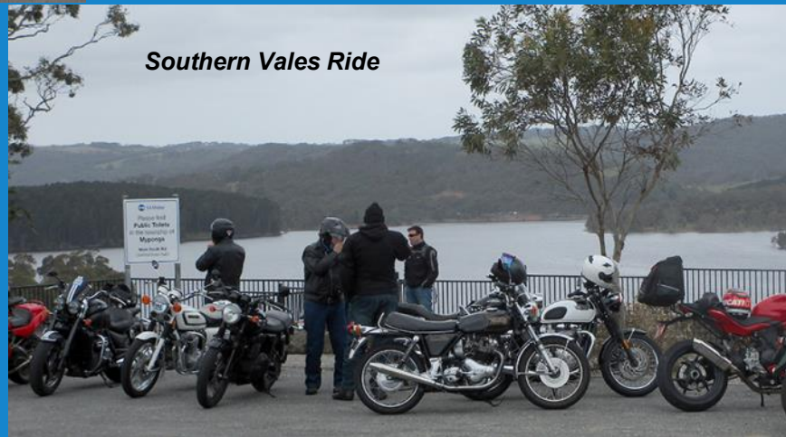
Southern Vales Ride