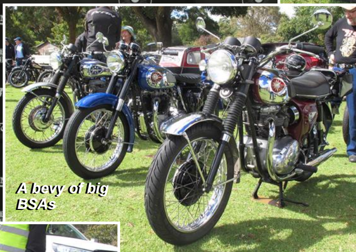
A bevy of big BSAs