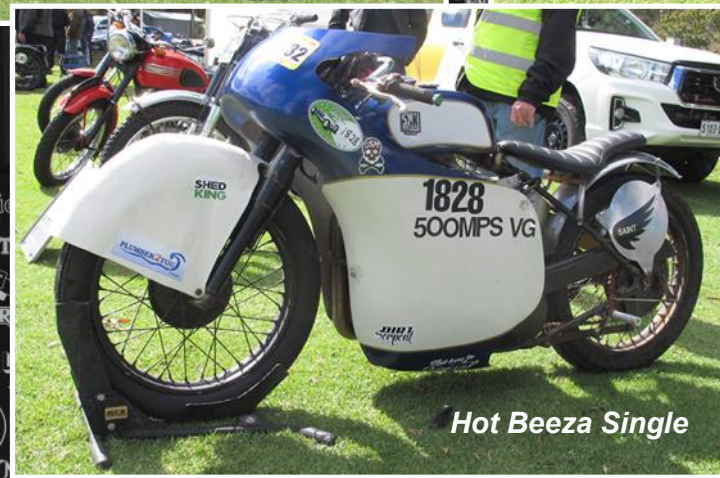
Hot Beeza Single