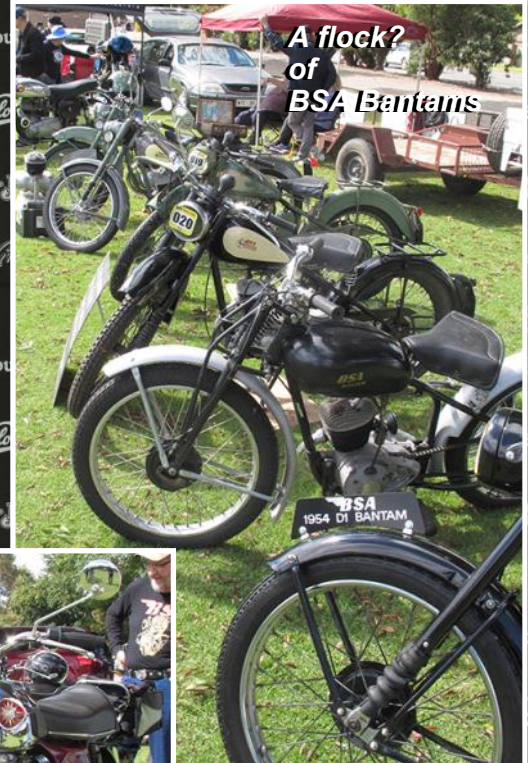
A flock? of BSA Bantams