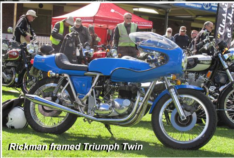
Rickman framed Triumph Twin