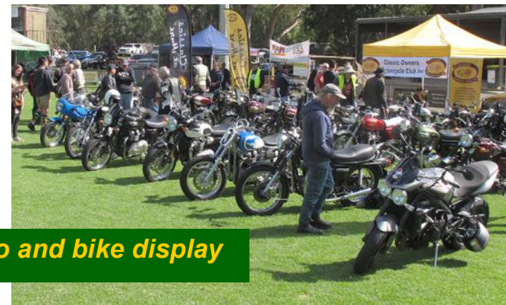
COMCC gazebo and bike display