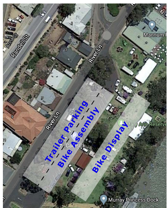
Mary Ann Reserve, Randell St. Mannum