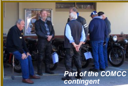
Part of the COMCC contingent