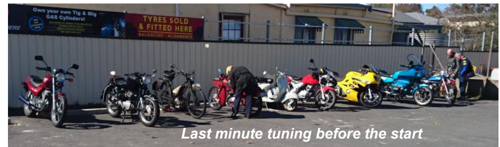
Last minute tuning before the start

NEXT RUN: Mount Barker Burble Sunday 11 th October 2020