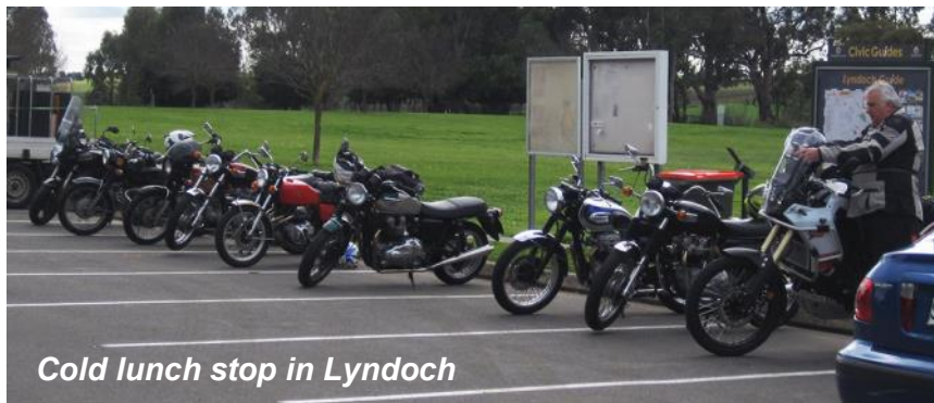
Cold lunch stop in Lyndoch