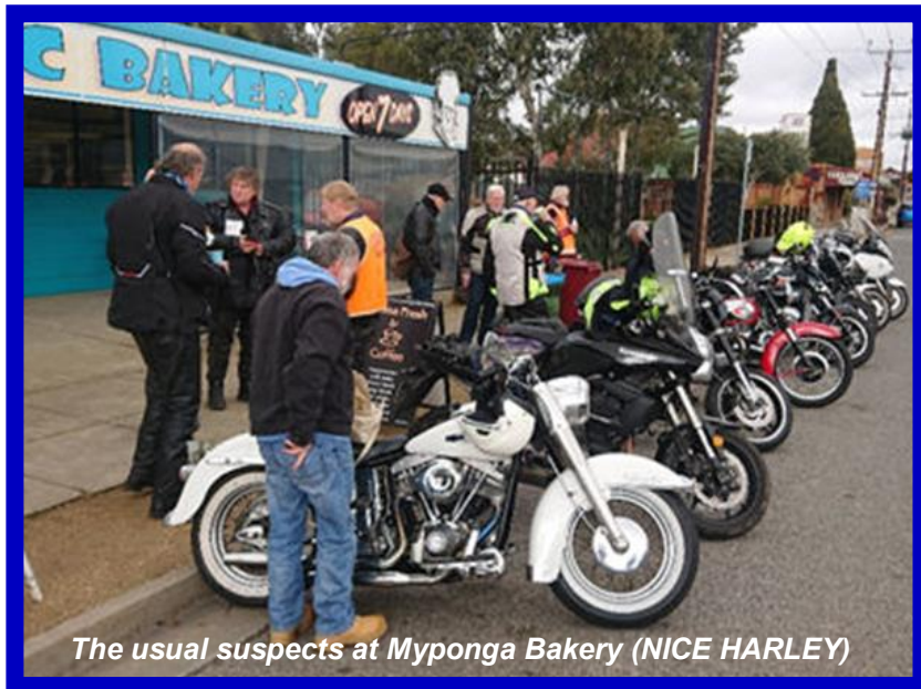
The usual suspects at Myponga Bakery

This is my first official club run as Captain and if getting riders dislodged from the official route, then I was a resounding success! We set off towards Clarendon where along the way riders thought of a better route and turned left up Chambers Hill Road for which to my recollection I hadn't posted a corner marker. Fortunately, in the morning briefing, I mentioned that we were stopping at Myponga for brunch. We met up along the way with most of the dissidents.