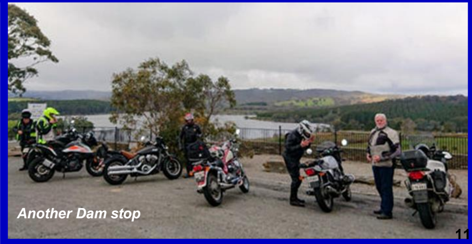
Another Dam stop