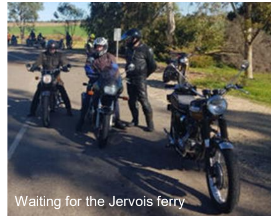
Waiting for the Jervois ferry

Turning left on Bowhill Road and then sharp right on to Burdett Road, we made our way to the ferry at Mannum only to find that the bakery in the main street is closed on Sundays. More the fool them as there were literally hundreds of people in town. We made do with fish and chips and enjoyed a pleasant repast in the park down by the river. Many of the world's problems were discussed, but I'm pretty sure none were solved.