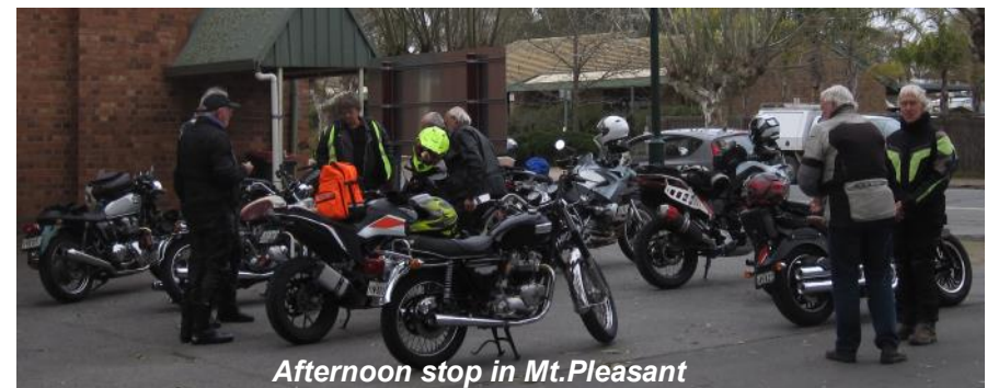
Afternoon stop in Mt. Pleasant