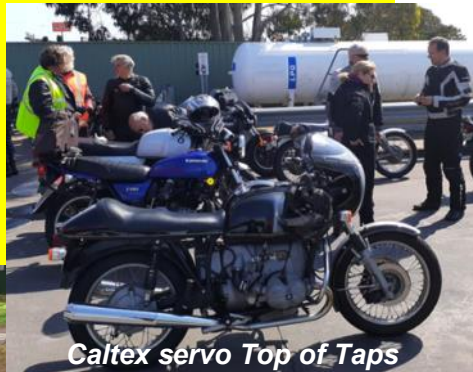
Caltex servo Top of Taps