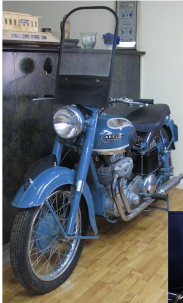
1933 600cc Square 4 V