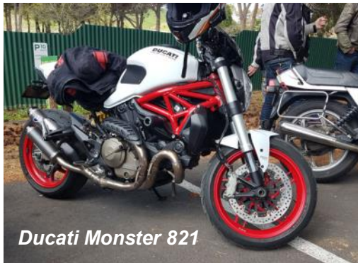
Ducati Monster 821