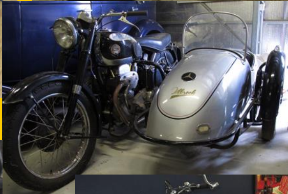
Ariel Sports Arrow