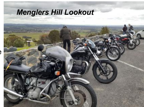
Menglers Hill Lookout

About 210km all up. In spite of the weather and some geographical gaffes I think most people enjoyed themselves.