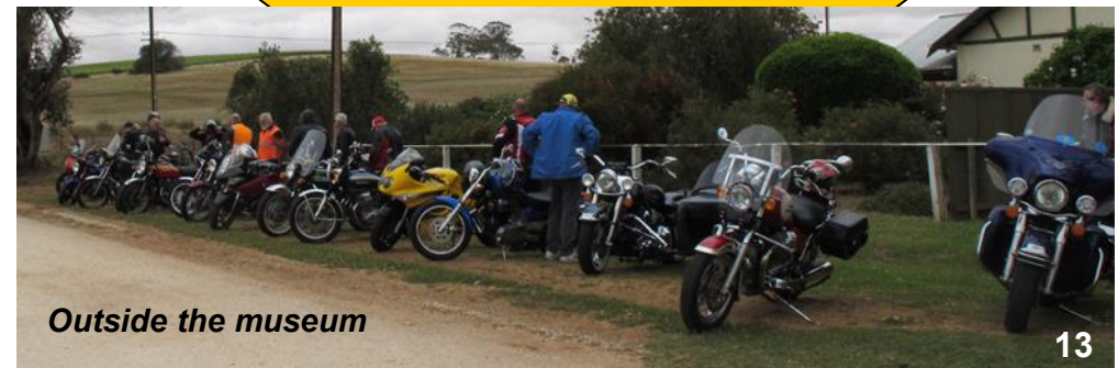
Outside the museum