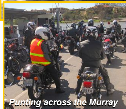
Punting across the Murray