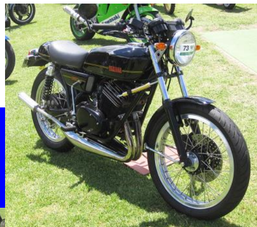
Tricked out Yamaha 350—note the head