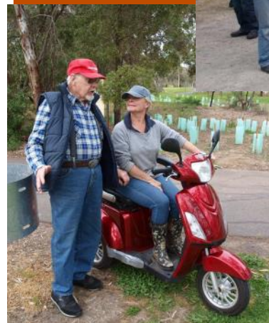
Pud: 'Sorry love. No hi-viz vest, no ride'