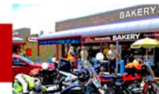
Lunch stop at Yankalilla