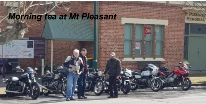
Morning tea at Mt Pleasant

The forecast for Sunday 8 September was not promising with showers and gusty winds predicted. Nevertheless, five brave souls met at Civic Park, Modbury. At first it looked like a big turnout, but another club had coincidentally arranged to meet at the same place and time for a run, at least initially on the same route as ours, to Mount Pleasant for morning coffee! We received a plaintive call from one member who had gone to the wrong starting point.