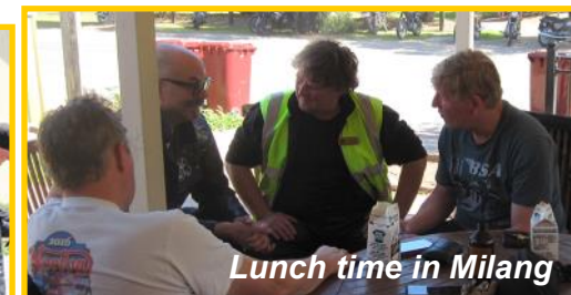
Lunch time in Milang