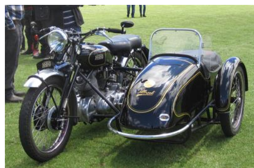
Another superb Tilbrook