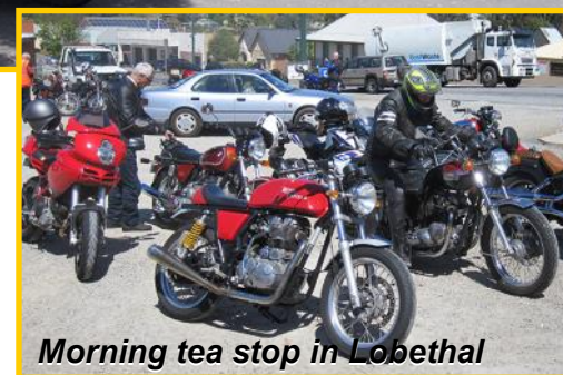
Morning tea stop in Lobethal