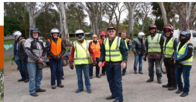
The dirty dozen