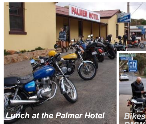
Lunch at the Palmer Hotel

After a very welcome warming break, it was on the bikes again along Hill Road, Martin's Hill Road and Cromer Road through Birdwood and on to Mount Pleasant. A right turn on to Angus Valley Road and another along the now abandoned Monarto to Sedan railway through Milendella and past the Apamurra silos before yet another right turn on the main Mannum