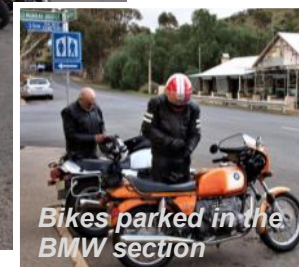
Bikes parked in the BMW section

road. Then it was just a few kilometres back to our lunch stop at the old Palmer Hotel.