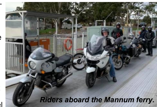
Riders aboard the Mannum ferry.

Into Taillem Bend and a fuel stop for the Suzuki, which can just about make it from one pump to the next! Then a new route for us north through the Mallee – still pretty dry out there – across the Karoonda Highway and then back towards the river and our second ferry crossing into Mannum and the Pretoria Hotel for lunch. The Sunday special, roast lamb, was excellent value!