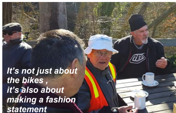
It's not just about the bikes, it's also about making a fashion statement