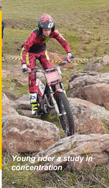
Young rider a study in concentration