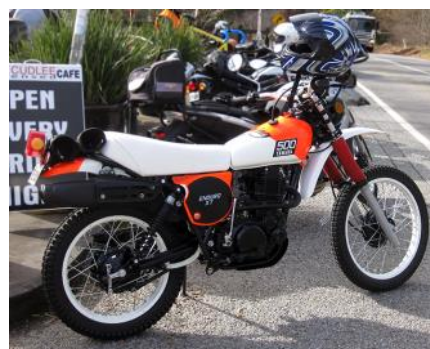
Dean's beautifully restored and unique Yamaha 500XT

After coffee we investigated Lee's Spot On Motorcycles where I bought a new pair of waterproof gloves, which naturally meant we encountered dry conditions for the rest of the day. Thanks to our ride leaders. TJ