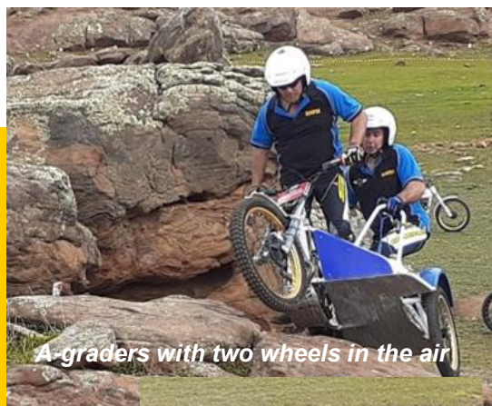
A graders with two wheels in the air