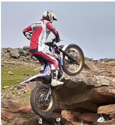
Riding onto an over-hanging rock