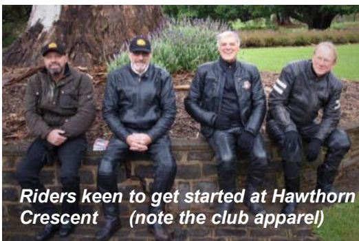
Riders keen to get started at Hawthorn Crescent (note the club apparel)

Nine brave souls ignored the cold and overcast conditions on Sunday