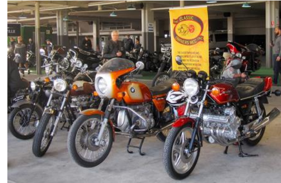
< Part of the COMCC display

We took the opportunity to promote the club's 19 October MILL TO MILL RIDE. Banners went up and posters and flyers were handed out. The bonus for those attending was to get a look at some interesting machinery. TJ