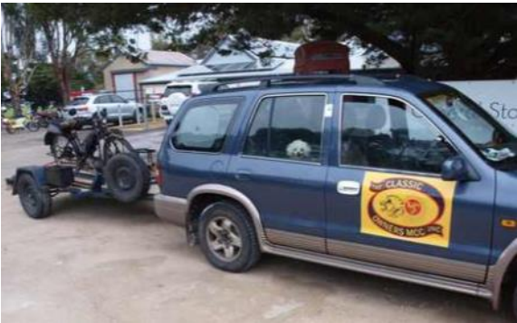
Mr Happy (dog) in the official COMCC car with Excelsior autobyk in tow

REMEMBER: These runs cater for the slower rider, back-up trailer always provided