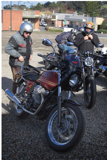
Moto-Guzzi V7 is becoming a popular choice.