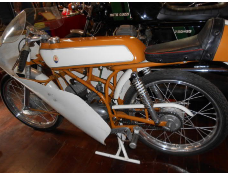
Above Maserati, Right The Red tyres were made as a limited batch of 200 in Germany, and he managed to get 2. Above Itom very popular years ago in 50 cc racing.