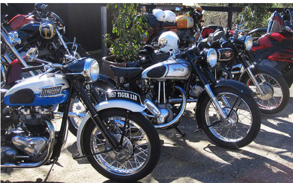
Some bikes are almost as old as the riders